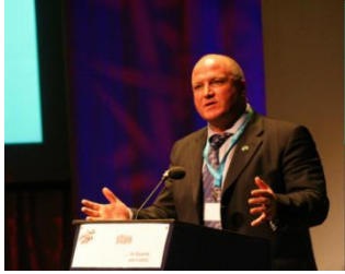
OVER THE MOON: Bob Crow