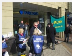
LEAFLETING: UNISON activists

While the majority of the British public are suffering in the face of cuts on a record scale, it's alright for some of Britain's top bankers. Bob Diamond, boss of Barclays, is due to collect a bonus of £6.5 million pounds, whilst his bank gets away with paying 1% corporation tax on their vast profits.